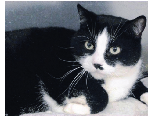
Shelter life has not been easy for Socks.

Socks is a handsome black and white cat with the proverbial four white socks! Surrendered in November last year, Socks has been in residence for six months. Settling into Shelter life has not been an easy journey for Socks; he found it traumatic; he was extremely nervous and scared to the point that he spent his days huddling in the back of his cage. He felt if he was hidden he was safe; socialization with the other cats was out of the question.