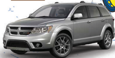
2015 DODGE JOURNEY CVP