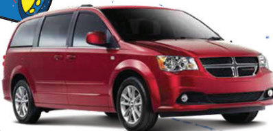
2015 DODGE GRAND CARAVAN CVP