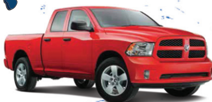
2015 RAM 1500 SXT QUAD CAB 4X4 $26,995*

HOW LOW CAN WE GO? WE'LL ZAP YOUR CREDIT BLUES WITH LOW NON-PRIME RATES!