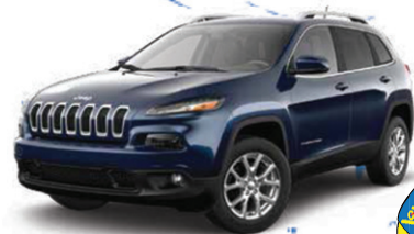
2015 JEEP CHEROKEE