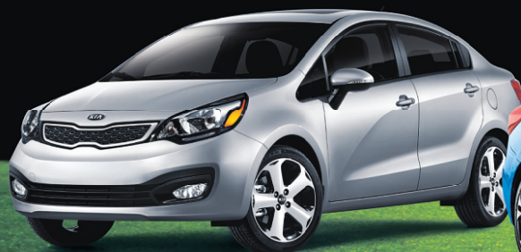
Rio4 SX with Navigation shown† Cash purchase price $24,064 hwy / city 100km : 6.3L/8.8L

On 2015 Forte and Sportage models only. S