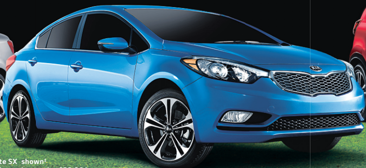
Forte SX shown† Cash purchase price $28,364 hwy / city 100km : 6.1L/8.8L