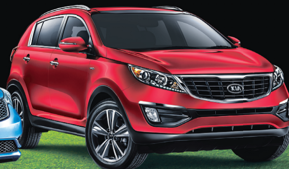
Sportage SX Luxury shown† Cash purchase price $40,344 hwy / city 100km : 8.3L/11.4L