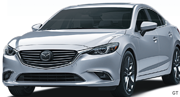
GT models shown