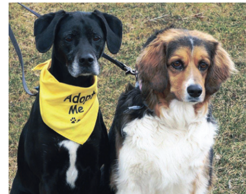
Bailey (left) and Ginger are bonded and need to be adopted together.

The pluses for making room in your home for these lovelies are many. Both are very clean and have never once soiled their kennel, can be left alone at home with no mishaps or surprises. Both dogs are mellow; both like car rides (although Ginger falls asleep), both are gentle and Ginger especially is generous with her kisses. Bailey would also love access to beaches and water! The ladies