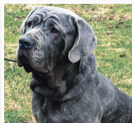
Sterling - adopted May 2014