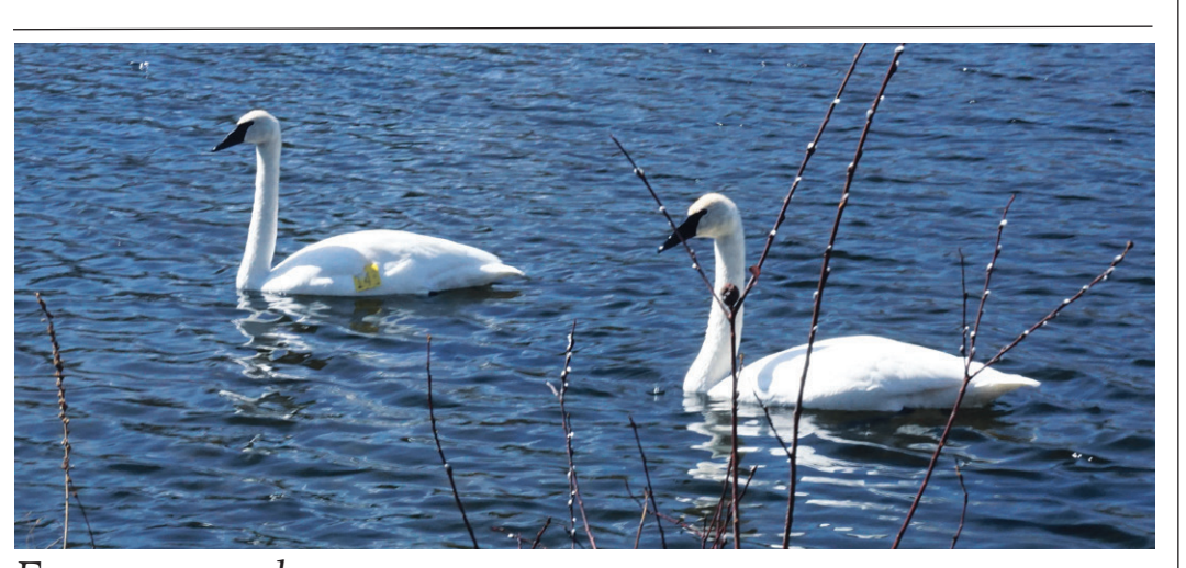
From our readers