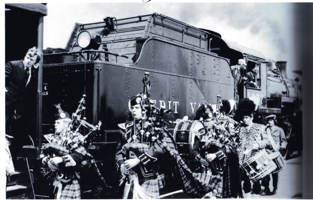
The Lorne Scots pipe band welcomes a Credit Valley steam engine to Georgetown Station for the inauguaral run of the GO Train in April 1974.