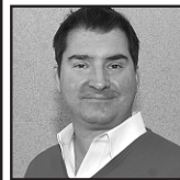
By Cory Soal R.H.A.D.

We sincerely apologize for any inconvenience this may have caused our valued customers.