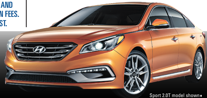
Sport 2.0T model shown*