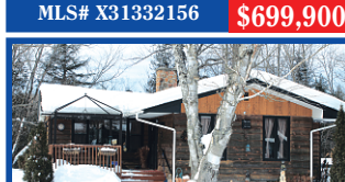
ORO-MEDONTE HOBBY FARM