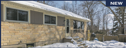
4 BEDROOM BUNGALOW

Bungalow located on quiet Cres, backing on to park, hardwood floors, new roof, garage and new driveway. Walk to schools, ravine and shopping.