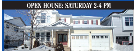
31 BROWNS CRES., ACTON