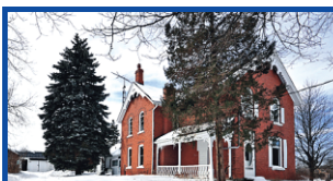
13046 REGIONAL RD 25, HALTON

3 BR - 2 WR - 440' X 367' LOT MLS# X3132156