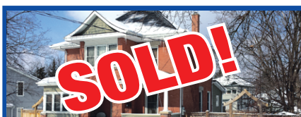
39 QUEEN ST., GEORGETOWN