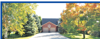
14 SANDALWOOD DR, BALLINAFAD

Kitchen to die for! 4 + 1 Bedroom - 3 WR Executive Estate home in historic Village of Ballinafad on a 1.07 Acre Lot