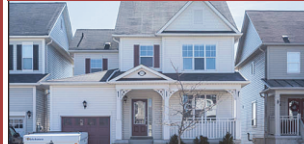
88 SOMERVILLE RD., ACTON.

BUNGALOW IN ACTON'S DESIRABLE HONEYFIELD NEIGHBORHOOD! Quiet Crescent * Open Concept * Hardwood * Pot Lights * Huge Kitchen w/breakfast bar * 2 Bedrooms upstairs + 1 in finished bsmt * Master has w/i closet & full ensuite * Awesome bsmt professionally finished w/ above grade windows, rec room, gas fireplace & bathroom * Newer deck in large, fenced backyard * Walk to schools, parks, arena & green belt nature trail.