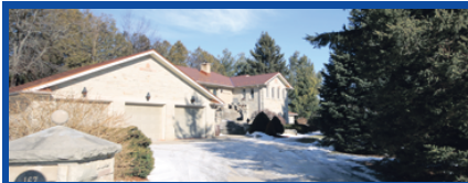
167 CONFEDERATION ST., GLEN WILLIAMS

Curb Appeal Galore in this 1900 sq ft Bungalow plus walkout basement on a gorgeous 180 X 269 lot