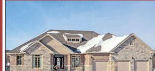
9274 WELLINGTON RD 22, HILLSBURGH.

3 BEDROOM HOME WITH WALK-OUT BASEMENT IN HONEYFIELD! Attractive home with covered front porch * Open concept * Beautiful kitchen w/ breakfast bar & high end stainless steel appliances * Crown molding * Walk-out to huge deck - great for this summer! * Master has 2 closets & ensuite * Upstairs office niche * Large unfinished basement already has full bathroom, above grade windows & walkout to fenced yard!