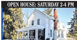
15 CONFEDERATION ST., GLEN WILLIAMS