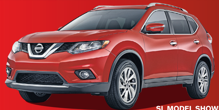
SL MODEL SHOWN

0 DOWN | $275 PLUS HST/MTH | 48 MTH LEASE | .99% | 20,000 KMS PER YEAR