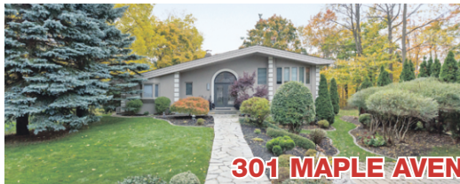
301 MAPLE AVENUE, GEORGETOWN

Thursday, January 29 th , 2015 6:00 p.m. – 9:00 p.m.