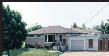
70 Raylawn Cres, Georgetown Sunday January 25, 2:00-4:00 $414,900 Sil Sells Team W3064980