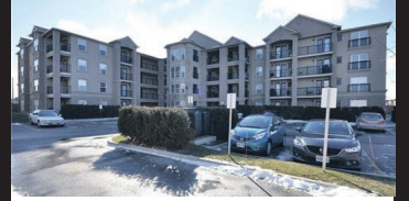
#206-1487 Maple Ave, Milton Saturday, January 24, 2:00-4:00 $259,900 Michelle Bell* W3098814