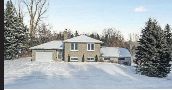
5739 Sixth Line, Erin Sunday January 25, 2:00-4:00 $689,000 Latamandlatam.com X3087012