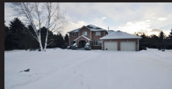
20 Credit River Rd, Erin Sunday January 25, 2:00-4:00 $659,000 Denise Dilbey** X3089773