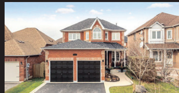
14123 Argyll Rd, Georgetown Sunday January 25, 2:00-4:00 $545,000 Sil Sells Team W3079702