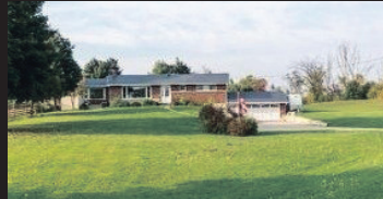
6480 Highway 7, Halton Hills Sunday January 25, 2:00-4:00 $649,900 Andelka Pejic* W3036104