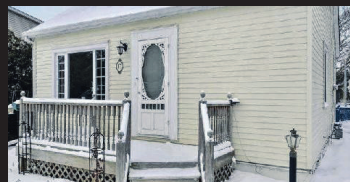
17 Dundas St, West, Erin Sunday, January 25, 1:00-4:00 $374,500 Carrie Dodds* X3035299