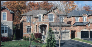
31 Hellyer Ave, Brampton Sunday January 25, 2:00-4:00 $879,900 Anthony Maan* W3097593