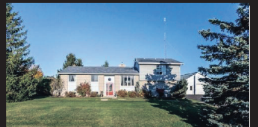
10119 Highway 7, Halton Hills Sunday, January 25, 2:00-4:00 $649,900 Mimi Keenan* W3052742