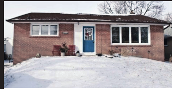
26 Sargent Rd, Georgetown Sunday, January 25, 2:00-4:00 $422,900 Elaine Jones* W3089088