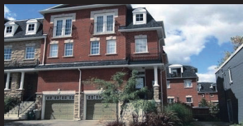
16 Wesleyan St, Georgetown Sunday January 25, 2:00-4:00 $415,000/$2,000 Sil Sells Team W3092010