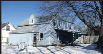
39 Wellington St, Acton Saturday January 24, 2:00-4:00 $359,900 Tracy Myers* W3087065