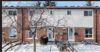
110 Kingham Rd, Acton Sunday, January 25, 2:00-4:00 $234,900 Tracy Myers* W3086971