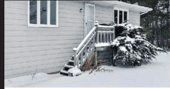
063013 Dufferin Rd 3, East Garafraxa Sunday January 25, 2:00-4:00 $299,000 Latamandlatam.com X3084846