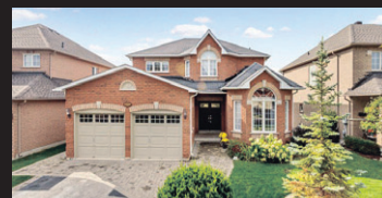
12 Bowman St, Georgetown Sunday January 25, 2:00-4:00 $749,900 Sil Sells Team Exclusive