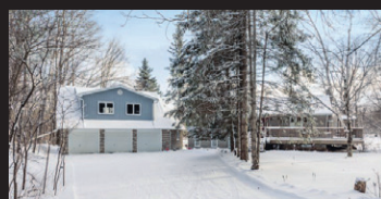
11 Hilltop Rd, Hillsburgh Sunday January 25, 2:00-4:00 $819,000 Haltonhomes.com X3094135