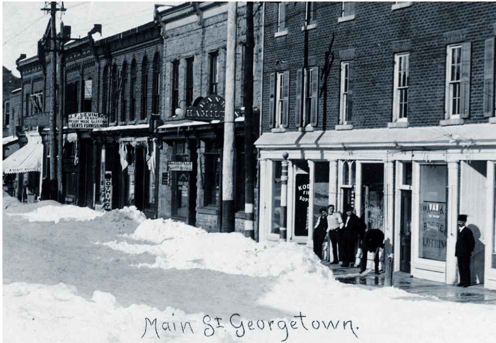
Main St. Georgetown.

YOU LIKE SNOW?: The weather forecast for the holidays is yet uncertain but if we match this winter scene of Main Street, Georgetown from 1910 then it may not be fun. Shown here are stores in the McGibbon block including the Bank of Hamilton and the Herald Office (precursor to the Independent).