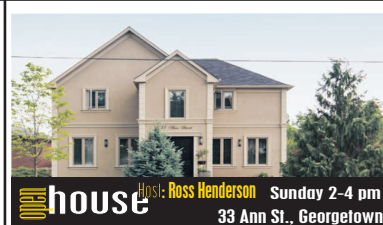
house Host: Ross Henderson Sunday 2-4 pm 33 Ann St., Georgetown

Good Old Country Living! 3 bdrm bungalow on just under .5 of an acre in superb south Georgetown. Great for commuters - Just minutes to main road. Finished basement with Rec Rm. Nicely landscaped. $499,900.00 Georgetown MLS#W3072058