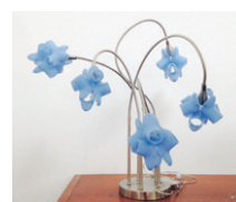
Image of a desk lamp we made from up-cycled Febreze trigger heads.

It's all part of a new contest initiated by local eco start-up TerraCycle Canada and air care gurus at Febreze— whoever collects the most air and home care waste for us to recycle will get $3,000 to spend as they wish on community projects, charities or other initia-