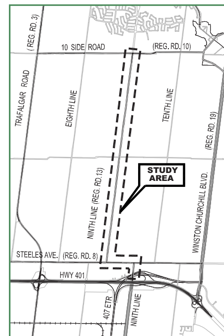
The map shows the approximate limits of the study area.

Date: Thursday, November 20, 2014 Time: Drop-in: 6:30 – 8:30 p.m. Location: Georgetown District High School - Cafeteria 70 Guelph Street, Halton Hills ON L7G 3Z5