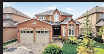
12 Bowman St, Georgetown Sunday November 2, 2:00-4:00 $749,900 Sil Sells Team W3036272