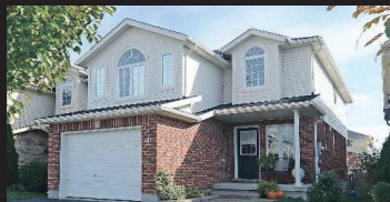
31 Warren St, Guelph Sunday November 2, 2:00-4:00 $379,900 Monica Keess* X3051950