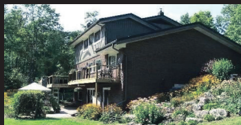
7078 Seventeenth Sdrd, Halton Hills Sat Nov 1 & Sun Nov 2, 2:00-4:00 $899,000 Denise Dilbey** W2872680