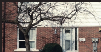
110 Kingham Rd, Acton Sunday November 2, 2:00-4:00 $234,900 Cathy Graham-Smith* Coming Soon