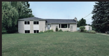
15 Bennett Pl, Georgetown Sunday November 2, 2:00-4:00 $695,000 Sil Sells Team W3023839