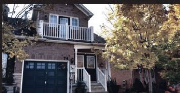
74 Dominion Gardens, Georgetown Sat Nov 1 & Sun Nov 2, 2:00-4:00 $424,900 Steve Jenkins* W3052057