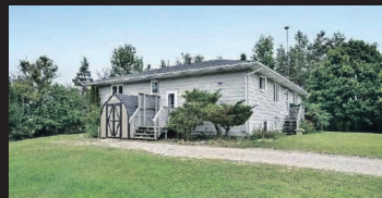
063013 Dufferin Rd 3, East Garafraxa Sunday November 2, 2:00-4:00 $299,000 Mark & Kevin Latam* X3049012