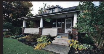
14400 Trafalgar Rd, Ballinafad Sunday November 2, 2:00-4:00 $489,900 Deborah Pierce* W3043433