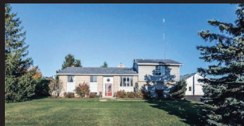
10119 Highway 7, Halton Hills Sat Nov 1 and Sun Nov 2, 2:00-4:00 $649,900 Glen Sheepwash* W3052742