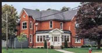
31 Young St, Acton Sunday November 2, 2:00-4:00 $724,900 Anelka Pejic* W3024872