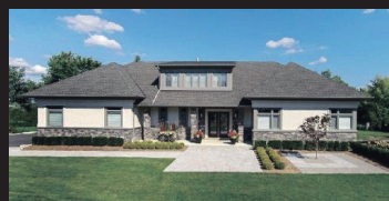
17 Thompson Dr, Georgetown Sat Nov 1 & Sun Nov 2, 2:00-4:00 $1,390,000 Halton Homes Team W3050629