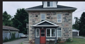
52 Trafalgar Rd, Hillsburgh Sunday November 2, 2:00-4:00 $354,900 Christine Monckton* X3037073