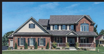
27 Armstrong St, Erin Sat Nov 1 & Sun Nov 2, 2:00-4:00 $899,000 Carrie Dodds* X3024960