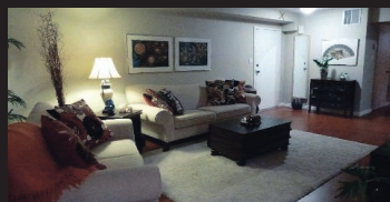
2701 Aquitane #79, Mississauga Sunday November 2, 2:00-4:00 $269,900 Sil Sells Team W3053710