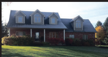
5 Purple Rd, Orangeville Sunday November 2, 2:00-4:00 $649,000 Derek Dunphy* Coming Soon