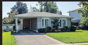
32 Pennington Cres, Georgetown Sunday November 2, 2:00-4:00 $449,000 Sil Sells Team W3027745