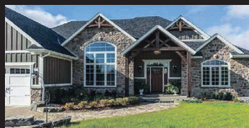
5924 Fourth Line, Erin Saturday November 1, 2:00-4:00 $899,900 Ritch Johansen* X2940854