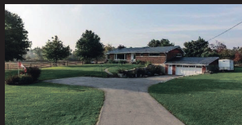
6480 Highway 7, Halton Hills Sunday November 2, 2:00-4:00 $649,900 Betty D'Oliveira* W3036104