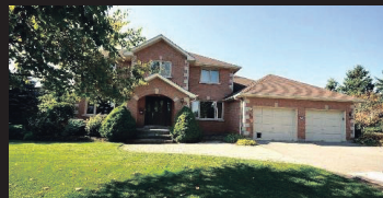
20 Credit River Rd, Erin Sat Nov 1 & Sun Nov 2, 2:00-4:00 $679,000 Denise Dilbey** X3031238