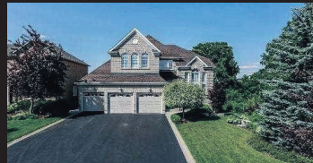
21 Grist Mill Dr, Georgetown Sunday October 26, 2:00-4:00 $1,175,000 SilSells Team W3040937