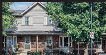
180 Marksam Rd # 61, Guelph Saturday October 25, 2:00-4:00 $205,000 Kevin Latam* X3038260