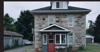
52 Trafalgar Rd, Erin Sunday October 26, 2:00-4:00 $354,900 Christine Monckton* X3037073