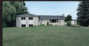
15 Bennett Pl, Georgetown Sunday October 26, 2:00-4:00 $695,000 SilSells Team W3023839