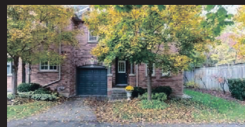
76 River Rd # 27, Georgetown Sat Oct 25 and Sun Oct 26, 2:00-4:00 $495,000 Valerie Keslick**/Halton Homes Team W3046030