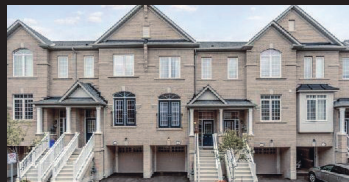
18 Promenade Tr, Georgetown Sunday October 26, 2:00-4:00 $419,900 Michelle Bell* W3039760