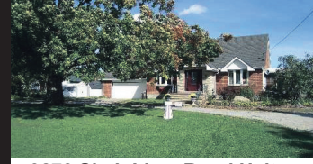
9273 Sixth Line, Rural Halton Sunday October 26, 2:00-4:00 $674,900 Glen Sheepwash* W3035484