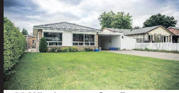
80 Windermere Crt, Brampton Sat Oct 25 and Sun Oct 26, 2:00-4:00 $379,900 The Mitchell Group W3044873