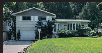
1681 Forks of the Credit, Caledon Sunday October 26, 2:00-4:00 $559,900 Laura Hayward* W2975114