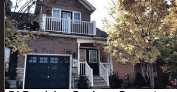
74 Dominion Gardens, Georgetown Sat Oct 25 and Sun Oct 26, 2:00-4:00 $424,900 Nusha Mathieson* Coming Soon