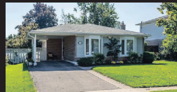
32 Pennington Cres, Georgetown Sunday October 26, 2:00-4:00 $449,000 SilSells Team W3027745