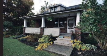
14400 Trafalgar Rd, Halton Hills Sunday October 26, 2:00-4:00 $489,900 Lisa Hartsink** W3043433