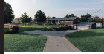
6480 Highway 7, Rural Halton Sunday October 26, 2:00-4:00 $649,900 Carrie Dodds* W3036104