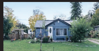
42 Memorial St, Eden Mills Sunday Oct 26, 2:00-4:00 $365,000 Tracy Myers* X3039741