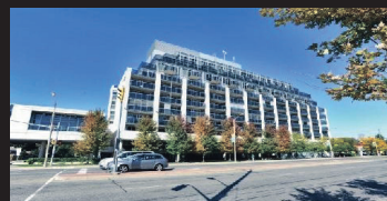
1040 The Queensway # 609, Toronto Saturday October 25, 2:00-4:00 $344,900 Laura Smith* W3028897