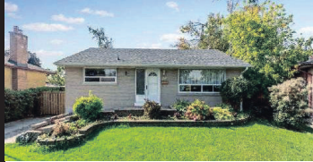
24 Mcgilvray Cres, Georgetown Sunday October 26, 2:00-4:00 $424,900 Peter Zavitz* W3036114