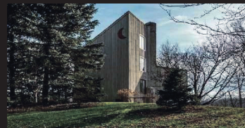
5222 Tenth Line, Erin Sunday October 26, 2:00-4:00 $515,000 Kevin Latam* X3044222