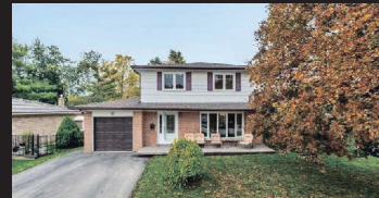
18 Metcalfe Crt, Georgetown Sunday October 26, 2:00-4:00 $499,900 The Maan Team W3047090