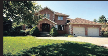
20 Credit River Rd, Erin Sat Oct 25 and Sun Oct 26, 2:00-4:00 $679,000 Denise Dilbey** X3031238