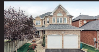
14143 Argyll Rd, Georgetown Sunday October 26, 2:00-4:00 $584,900 SilSells Team W3025016