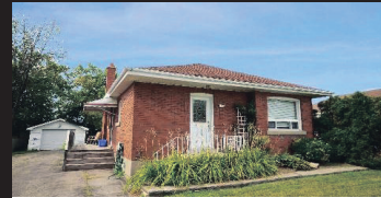
210 John St, Brampton Saturday October 25, 2:00-4:00 $399,900 The Mitchell Group W2991624