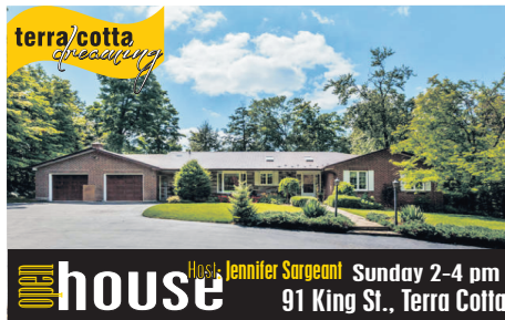
house Host: Jennifer Sargeant Sunday 2-4 pm 91 King St., Terra Cotta

Sitting Pretty! Sprawling custom bungalow (~2,400 sq ft) with oversized double garage, metal roof & walk out from lower level. Total seclusion on 3.49 acres. $859,900.00 Terra Cotta MLS#W3028798