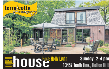
house Host: Holly Light Sunday 2-4 pm 13457 Tenth Line., Halton Hills

Why Buy A Painting?? 700 ft of Credit River frontage on magnificent 1.8 acres in Terra Cotta. Executive bungalow (2000 sq ft), fin bsmnt, 3 car garage & multi-level deck. $974,900.00 Terra Cotta MLS#W2961722