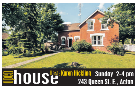
house Host: Karen Hickling Sunday 2-4 pm 243 Queen St. E., Acton

Location, Location, Location! Updated 3+ bedroom bungalow with finished lower level and a garage on a huge mature lot. Steps to GO & short walk to downtown. $449,900.00 Georgetown MLS#W3026659