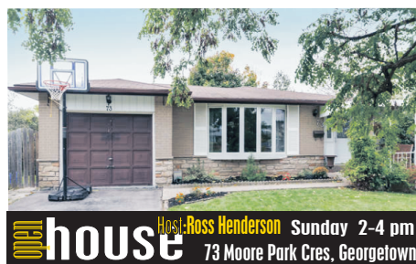
house Host: Ross Henderson Sunday 2-4 pm 73 Moore Park Cres, Georgetown

Don't Dilly Dally! Or you will miss out on this charming & lovingly maintained 4 bdrm, 2 bath century home on large mature lot. Short walk to Go, shops & schools. A must see! $374,900.00 Acton MLS#W3044663