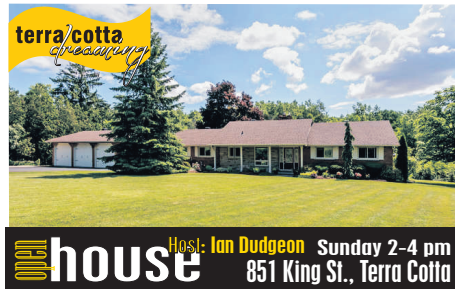
house Host: Ian Dudgeon Sunday 2-4 pm 851 King St., Terra Cotta

Sitting Pretty! Sprawling custom bungalow (~2,400 sq ft) with oversized double garage, metal roof & walk out from lower level. Total seclusion on 3.49 acres. $859,900.00 Terra Cotta MLS#W3028798