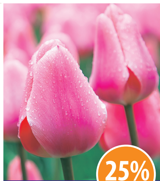
All Pink Tulip Bulbs