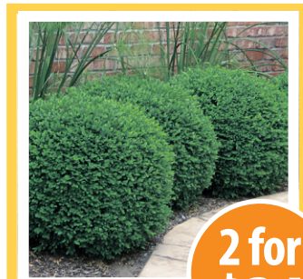
Boxwood -3 Gal. Green Mountain or Green Velvet $19.99/ea, Reg. $29.99