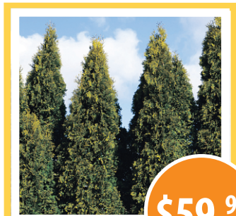
Emerald Cedar 10 Gal., grown in Canada, 5'-6' tall, Reg. $99.99