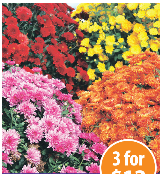
Colourful 6" Mums, Reg $5.99/ea