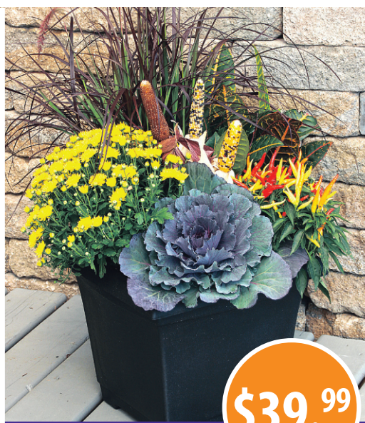
15" Fall Planter, Reg. $49.99