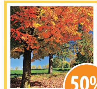
All Shade Trees