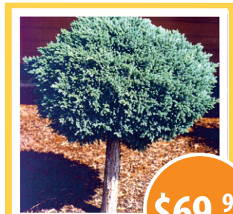
Evergreen Standards (assorted varieties) Reg. $129.99