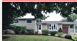
47 MARILYN CRESCENT, GEORGETOWN

LOCAL AND WORLDWIDE EXPOSURE FOR YOUR HOME