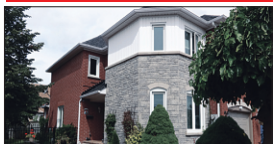
17 JAMES YOUNG DR, GEORGETOWN

I donate a portion from every purchase & sale to the Royal LePage Shelter Foundation