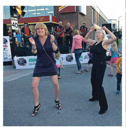
Rocker and the Hemi Heads.