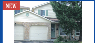
44 DANVILLE AVE., ACTON $299,900 MLS# W2980731