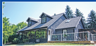
9459 FIVE SIDEROAD, ERIN $799,999 MLS# X2955795