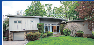
22 MARKET ST, GEORGETOWN $899,999 MLS# W2919487