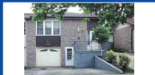
4 GREENORE CRES., ACTON $319,900 MLS# W2942870