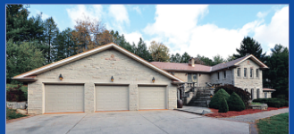
167 CONFEDERATION ST., GLEN WILLIAMS $1,049,000 MLS# W2963827

COMMERCIAL / INVESTMENT 10 GUELPH STREET, GEORGETOWN. $350,000. 66' X 132' LOT - CALL BILL