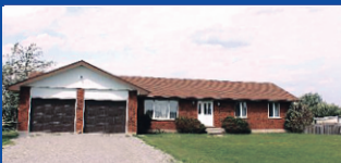
8223 EIGHTH LINE, GEORGETOWN $674,900 MLS# W2959354