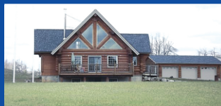
9516 FIVE SIDEROAD, ERIN $950,000 MLS# X2942926

Come Out and Visit us at The Leathertown Festival in Acton, this Sunday, Aug 10 - Always a Good Time!