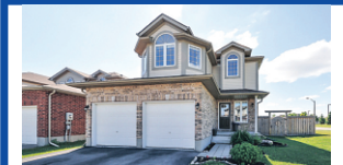
1 BROCK ST, GUELPH $489,900 MLS# X2953611

Come Out and Visit us at The Leathertown Festival in Acton, this Sunday, Aug 10 - Always a Good Time!