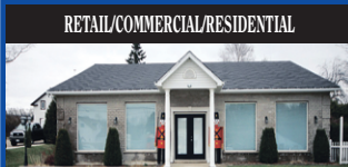
19A TRAFALGAR RD., HILLSBURGH $739,900 MLS# X2790699 & X2790712