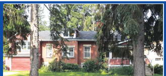
507 KING STREET, NORVAL $399,900 MLS# W2970588