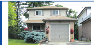
27 ROSSET VALLEY CRT., GEORGETOWN $434,900 MLS# W2961515

Check out our information videos at www.youtube.com/MCQWIN