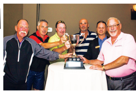
See inside for President's Cup action!