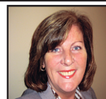
Rose Mary Morris Broker

2 - BEDROOM - GORGEOUS SUITE - IMMEDIATE OCCUPANCY - LOWER FLOOR. IMMACULATE UNIT. IN SUITE LAUNDRY, TWO WASHROOMS, LIVING/DINING AND BALCONY. INDOOR POOL, SAUNA, HOT TUB, TENNIS COURTS, BBQ, PARTY ROOM, +++ SITUATED ON 5+ ACRES Call 416-993-0862 (c)