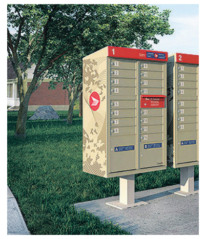
New community mail boxes are coming to neighbourhoods used to home delivery.

He said Canada Post plans to report back to area residents on the survey information by mail in the fall and he didn't know vet when it would be selecting the community box locations.