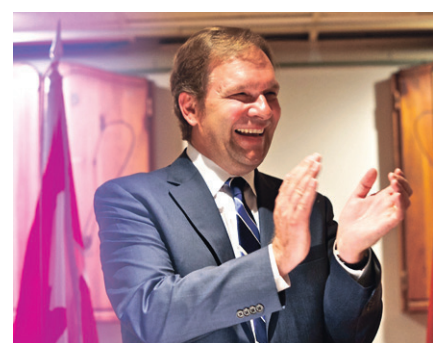
Election wrap-up, see pg. 3