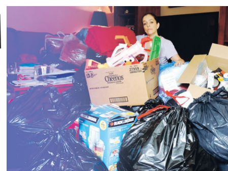
Collecting for fire victims, pg. 5