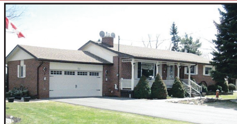
7 Coles Crt., Acton

0.4 acre lot on desirable street • Just minutes from town! • Impeccably kept 3 Bedroom bungalow • 3 Baths • Newer kitchen • Hardwood floors • Finished basement with wet bar & bonus room (use as a home gym, playroom, or office) • Gas fireplace & gas furnace new in 2014 • Who needs a cottage when you can have spectacular backyard like this? Features: mature trees, in-ground pool, cabana for changing & pool-side patio • Tiered deck with built in hot tub (new in 2013) & gazebo.