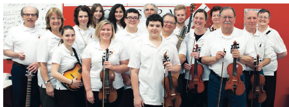
The Georgetown Celtic Fiddle Orchestra

328 Guelph Street | Georgetown | Ontario L7G 4B5 | TICO # 50018498 www.visiontravel.ca