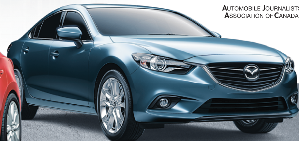
2014 MAZDA6 GT