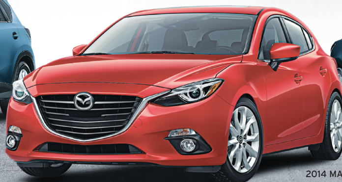
2014 MAZDA3 GT