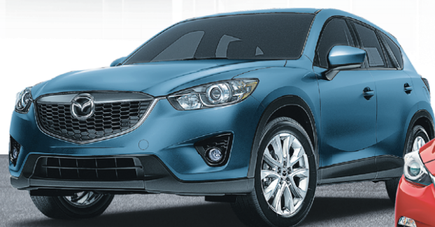
2014 CX-5 GT

AUTOMOBILE JOURNALISTS ASSOCIATION OF CANADA