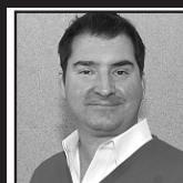
By Cory Soal R.H.A.D.

We sincerely apologize for any inconvenience this may have caused our valued customers.