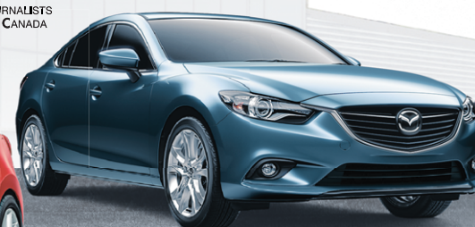
2014 MAZDA6 GT