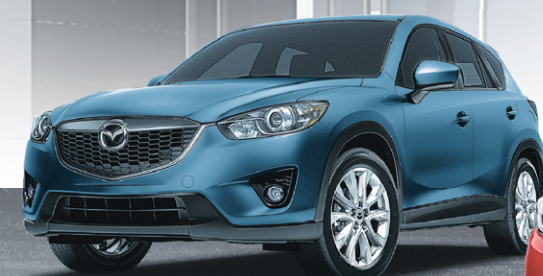
2014 CX-5 GT

2014 MAZDA6 CANADIAN CAR OF THE YEAR AWARD