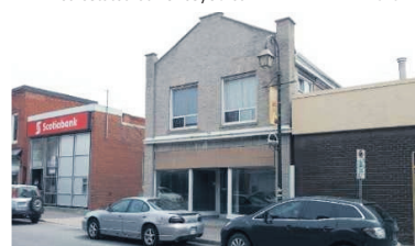
PRIME BUSINESS - CORE LOCATION IN ACTON $900/Month