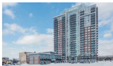
LUXURIOUS CONDO IN DOWNTOWN BRAMPTON $195,000