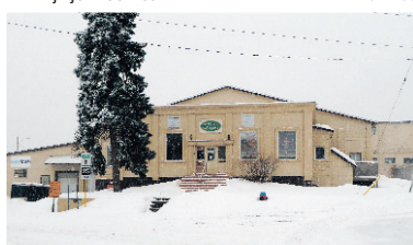
LARGE INDUSTRIAL SPACE FOR LEASE $6.00 Per Sq.Ft.