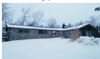
MUSKOKA IN CALEDON - 13 ACRES $749,900