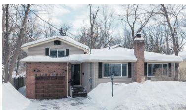
3+1 BDRM SIDESPLIT-SILVERCREEK RUNS THRU YARD $429,900