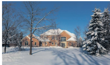
21 Trillium Terrace, Halton Hills Saturday, February 15, 2:00-4:00 $949,900