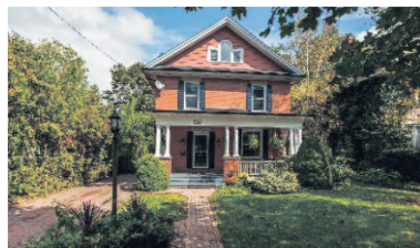
28 Charles Street, Georgetown Sunday, February 16, 2:00-4:00 $669,900