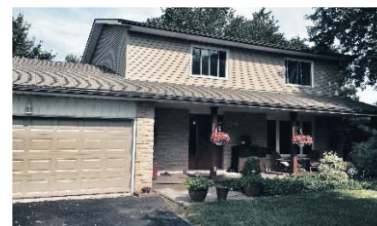
13129 Fifteenth Sideroad, Georgetown Sunday, February 16, 2:00-4:00 $599,000