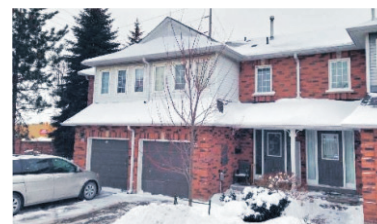
BEAUTIFUL 3+1 BDRM EXECUTIVE CONDO-TOWN $314,900