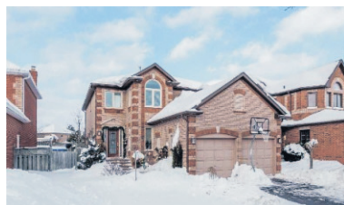
11 Lauchlin Crescent, Georgetown Sat, Feb.15 & Sun, Feb.16, 2:00-4:00 $599,900