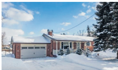
7 Coles Court, Acton Sunday, February 16, 2:00-4:00 $594,900