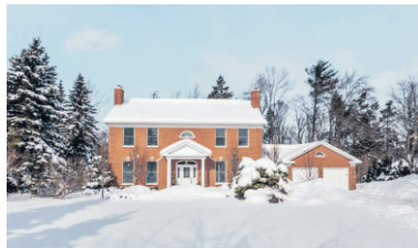
8 Oak Ridge Drive, Glen Williams Sunday, February 16, 2:00-4:00 $1,025,000