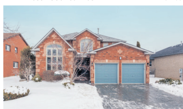
SPECTACULAR W/POOL & SUPERB FINISHED BASEMENT $849,000