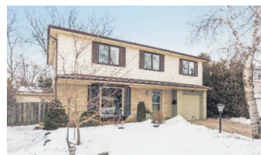
A RARE FIND WITH SO MUCH TO OFFER! $519,900