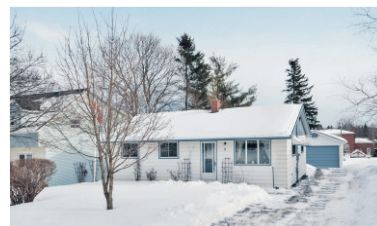
9 Water Street, Erin Sunday, February 16, 2:00-4:00 $289,900