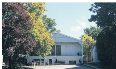
LOCATED CENTRALLY - MINUTES TO 401/407 $16 Per Sq.Ft.