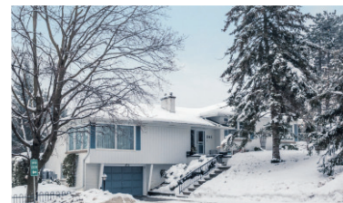
261 Maple Avenue, Georgetown Sat, Feb.15 & Sun, Feb.16, 2:00-4:00 $524,900