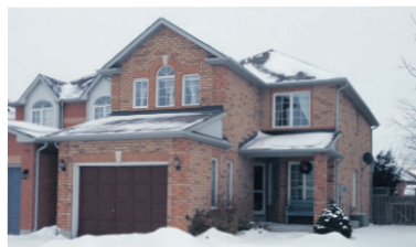
42 Munro Circle, Georgetown Sat, Feb.15 & Sun, Feb.16, 2:00-4:00 $469,900

Full listing details available at: www.johnsonassociates.ca