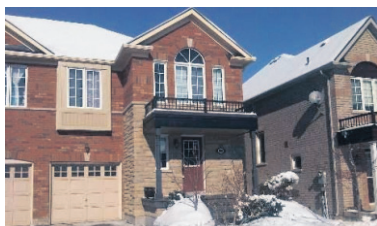
100 Mowat Crescent, Georgetown Saturday, February 15, 2:00-4:00 $419,000