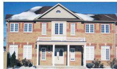
172 Miller Drive, Georgetown Sunday, February 16, 2:00-4:00 $608,000