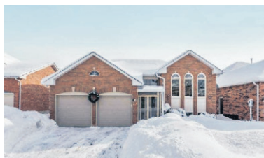
23 Banting Road, Georgetown Sunday, February 16, 2:00-4:00 $539,000