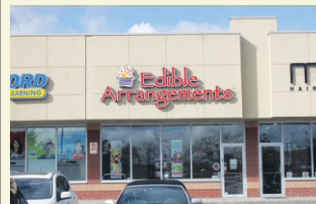
HIGH TRAFFIC RETAIL LOCATION

1200 sq ft retail, in newer building anchored by Tim Horton's, Swish Chalet & Service Ontario.