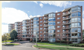
COUNTRY LIVING CLOSE TO TOWN

2800 custom home, on 1.1 acres, 4 bdrm, finished basement with inlaw/teen suite. $624,900