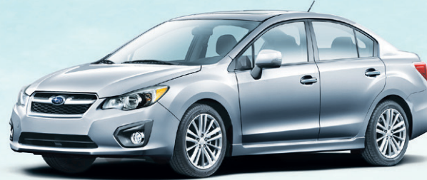
2013 IMPREZA 2.0i

STARTING FROM $21,923* LEASE PAYMENT $208 FOR 39 MONTHS*