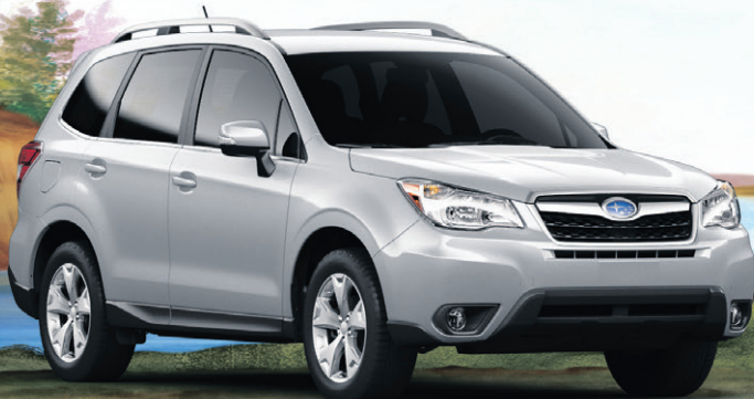
2014 FORESTER 2.5i

STARTING FROM $27,978* LEASE PAYMENT $268 FOR 24 MONTHS*