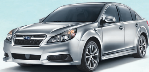
2013 LEGACY 2.5i

$500 Voucher towards any lease or purchase