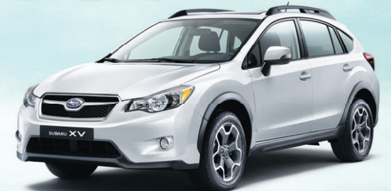
2013 XV CROSTREK

STARTING FROM $26,423* LEASE PAYMENT $284 FOR 39 MONTHS*