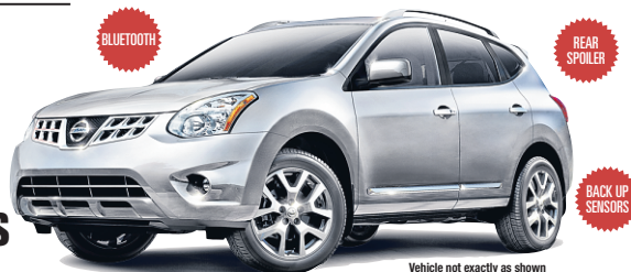
Vehicle not exactly as shown