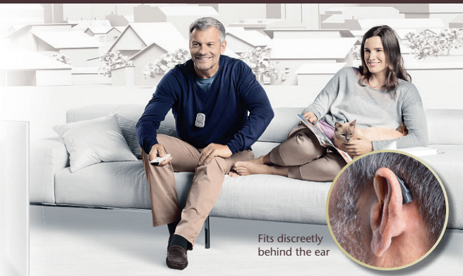
Fits discreetly behind the ear

*Restrictions apply. Contact clinic for details.