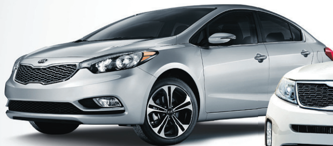
Forte SX shown Δ

THE NEW 2014s ARE HERE @ CLEAROUT RATES!