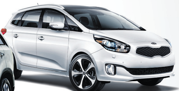
Rondo EX Luxury shown Δ

bi-weekly for 60 months, amortized over 84 months with $0 DOWN PAYMENT . Offer includes delivery, destination and fees. Offer based on 2014 Sorento 2.4L LX AT FWD with a purchase price of $28,893. Excludes HST.