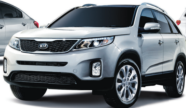
Sorento EX shown Δ

bi-weekly for 60 months, amortized over 84 months with $0 DOWN PAYMENT . Offer includes delivery, destination and fees. Offer based on 2014 Forte Sedan LX MT with a purchase price of $17,913. Excludes HST.