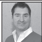
By Cory Soal R.H.A.D.

NEWSPAPER RETRACTION FOR THE FUTURE SHOP MAY 24 CORPORATE FLYER On page 1 of the May 24 flyer, the Samsung 55" / 60" F4300 Series Smart LED TV (UNS55F6300AEKZC / UNS60F6300AEKZC) and 280Watt 2.1 Channel Soundbar with Wireless Subwoofer (WFW450) (WebCode: 10243931 / 10243930 + 10241990) package was advertised with incorrect specifications. Please be advised that these TVs CANNOT transmit sound to the soundbar without wires, as previously advertised. Also, on page 20, the laundry pair: Samsung 4.1 Cu. Ft. Front-Load Washer (WF3618VBEWR) and 7.3 Cu. Ft. Dryer (DV3618VBEWR) (WebCode: 10236740 / 10236734) was advertised with an incorrect price. Please be advised that the CORRECT price for this laundry pair is $1399.98 with the "Buy More Save More" promotion. We sincerely apologize for any inconvenience this may have caused our valued customers.