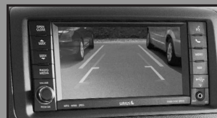
PARKVIEW ® REAR BACK-UP CAMERA