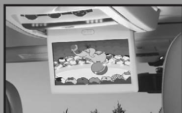
2 ND ROW OVERHEAD 9-INCH VIDEO SCREEN