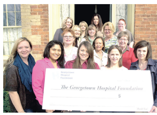
Thank You to the participating Local Businesses on this page!