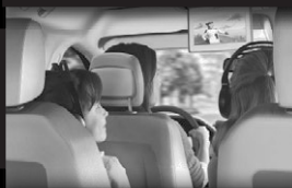
2 ND ROW OVERHEAD 9-INCH VIDEO SCREEN