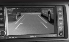
PARKVIEW ® REAR BACK-UP CAMERA