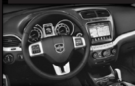
PREMIUM SOFT-TOUCH INTERIOR