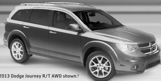
2013 Dodge Journey R/T AWD shown. 5