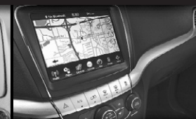
LARGEST TOUCH-SCREEN IN ITS CLASS ^