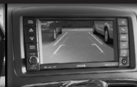
PARKVIEW ® REAR BACK-UP CAMERA