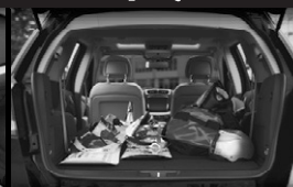
BEST-IN-CLASS STORAGE ®