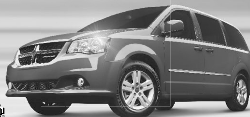
2013 Dodge Grand Caravan Crew Plus shown. 5