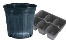
Plastic plant pots & trays