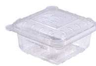
Clear plastic "clam shell" containers

You can now add the following new materials to your Blue Box: