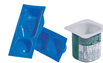
Single-serve plastic food containers No film or foil