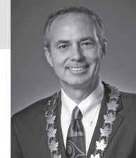
Gary Carr Regional Chair

With the arrival of spring, Halton residents will begin seeing more Building a Better Halton signs on local roads. The signs let you know that construction is about to begin in the area. They also are a reminder of the Region's commitment to safe drinking water, reliable wastewater collection, and safe and efficient roads. To learn more about Regional construction projects in your neighbourhood or along your commute route, visit www.halton.ca/construction . You'll find project information listed by city or town, alerts for road closures and lane restrictions, maps of the project areas, and links to your local municipality's construction information.