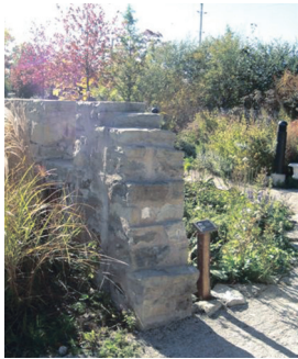
A portion of the sunken garden wall in the Old Seed House Garden.

their benefit performance to fund the restoration of its historic walled garden. These stone walls were the original foundation of the Dominion Seed House, a worldwide seed company founded by the Bradley family in 1928 with flower fields that graced the Guelph St./Maple Ave. corridor until its sale in 1993.