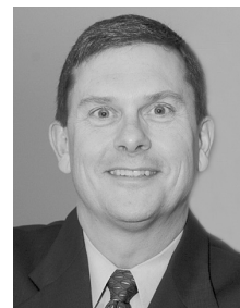
HHS CEO JOHN OLIVER

For a complete list visit: www.fin.gov.on.ca/en/publications/salarydisclosure/pssd/