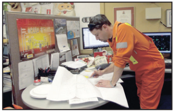
Storm war room