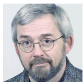
A Ted Bit: Surviving the storm