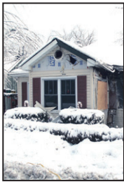
Christmas Day blaze