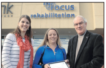
Testing for concussions