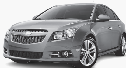
CRUZE LTZ SHOWN††