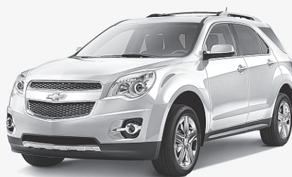
EQUINOX LTZ FWD SHOWN††