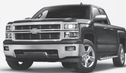
SILVERADO LTZ CREW CAB 4X4 SHOWN††