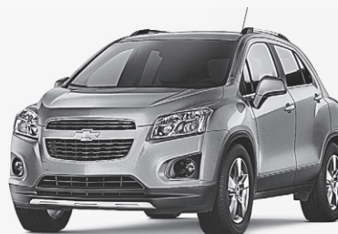
TRAX LTZ SHOWN††