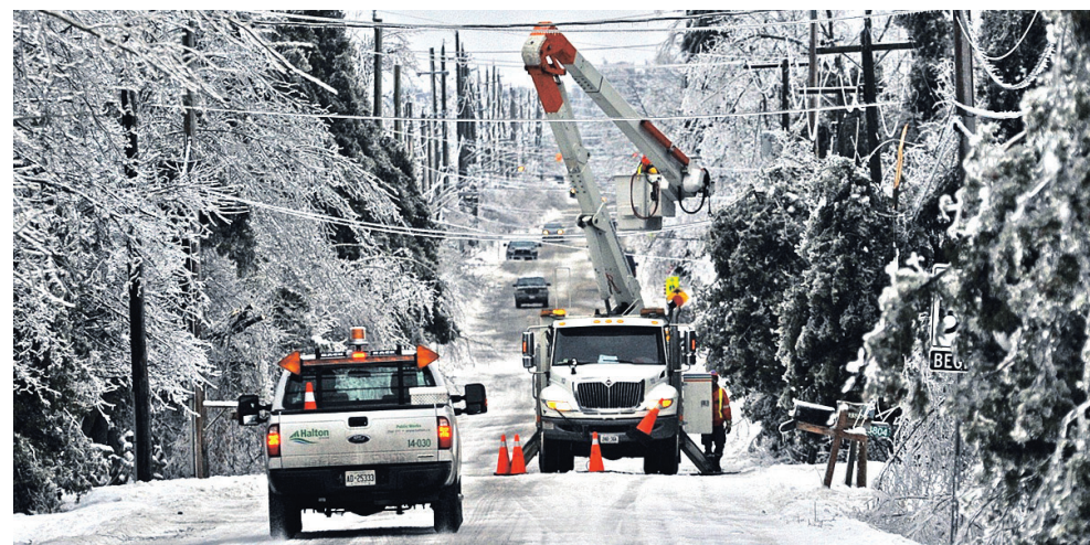
The icy scene left behind by the weekend storm might have been pretty if it wasn't so dangerous. Hydro crews have been working furiously to restore power throughout Halton Hills.