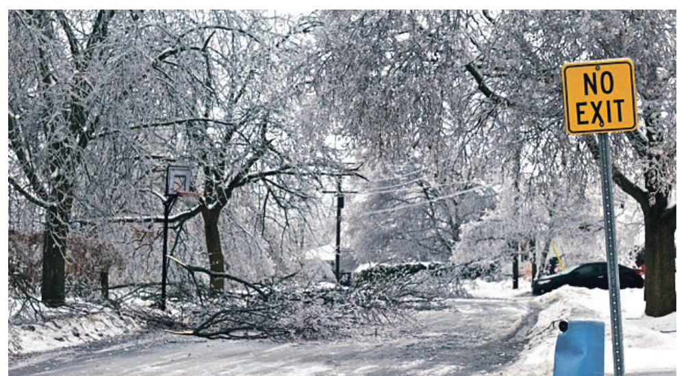
The weekend storm left trees strewn across many streets in Halton Hills, like Jessop Court (above), making the roads nearly impassable.