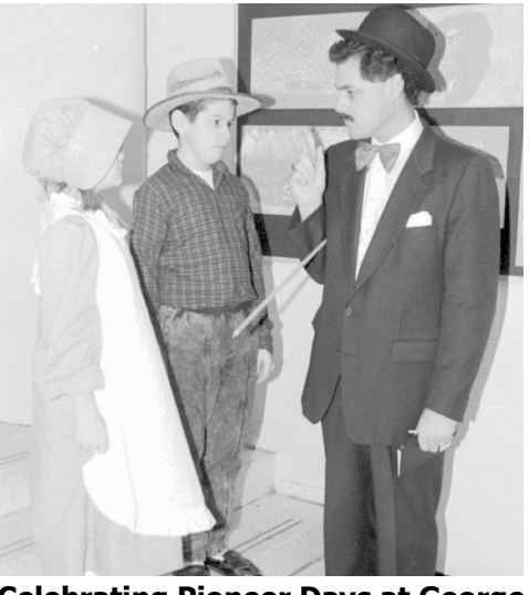
Celebrating Pioneer Days at George Kennedy Public School