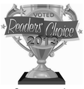
Georgetown's Favourite Auto Body Repair Shop