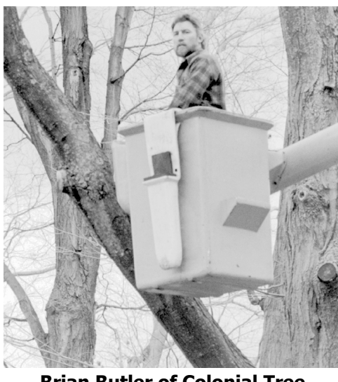
Brian Butler of Colonial Tree Service rescues a stranded cat