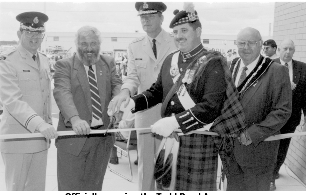
Officially opening the Todd Road Armoury