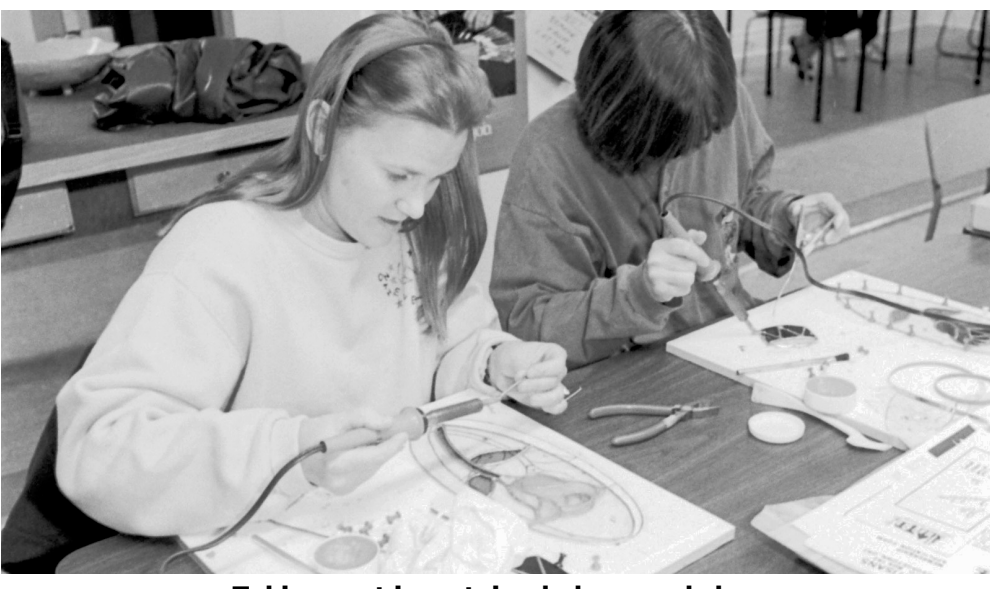
Taking part in a stained glass workshop